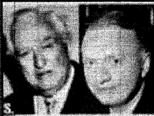
Sen. Pat Mc Carran (L) Rep. Francis Walter (R)

Any Immigration WITHOUT Assimilation is an INVASION by ENEMY FORCES!