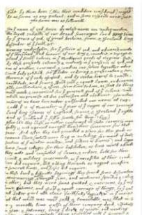
Mayflower Compact 1 st Assembly on this land