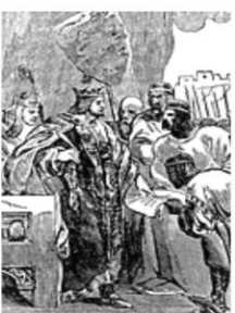
Signing the Magna Carta