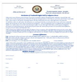
Declaration of Unalienable Rights