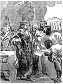
Signing the Magna Carta