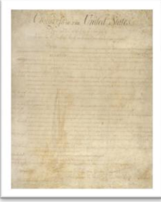
Peace Treaties Bill of Rights