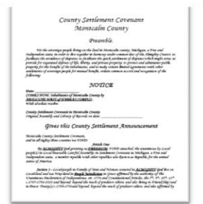
County Settlement Covenant